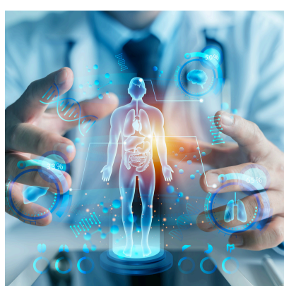
Natural & Health Science