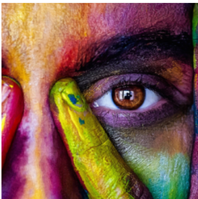
Arts & Humanities