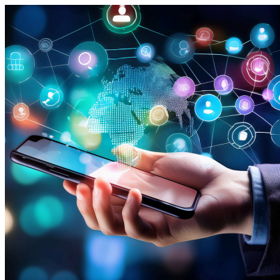
Business & Media