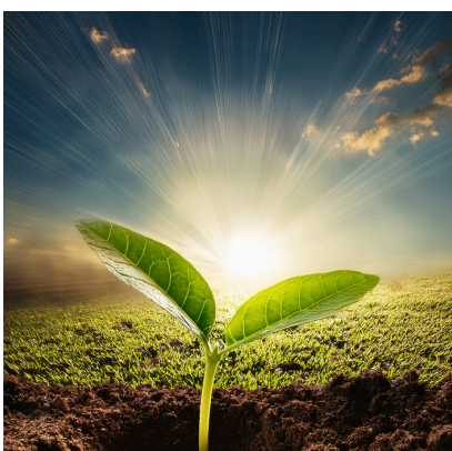
Life & Earth Sciences