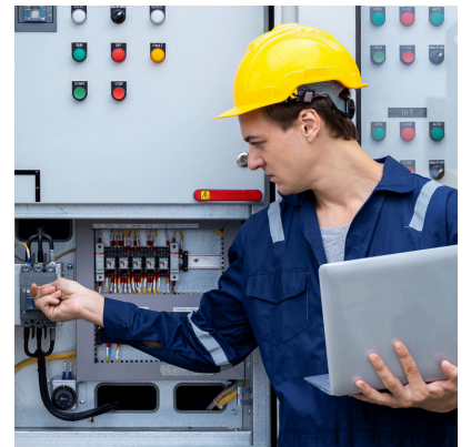
Engineering & Technology